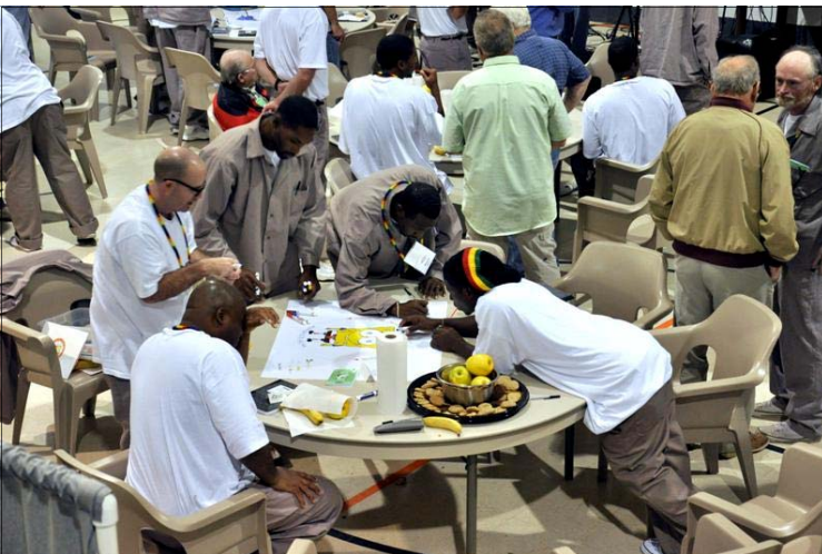
Participants making a poster on what the talk meant to them.

During the weekend there are 11 talks presented by Clergy and Lay persons. After each talk there is two minutes of silence for contemplation followed by a 20 minute family discussion about what the talk meant to them. Then as a family project the participants will make a poster in which they express their feelings about the talk. On the end of the day before going to the chapel, each family selects 2 posters and explains the meaning of the poster to the entire group.