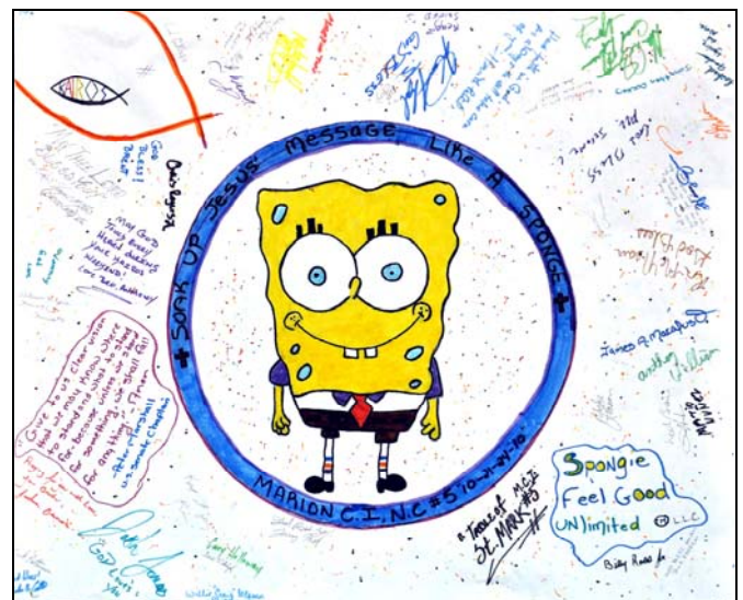
Inmates’ poster “Soak Up Jesus’ Message Like a Sponge

A typical 3½ day Kairos weekend needs 57 or more volunteers, 44 who go inside the penitentiary. The prison’s chaplain will select 42 inmates to participate. They will be divided into 7 table families. Each family consists of 6 inmates, a family leader, assistant family leader, a clergy, and a servant.