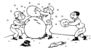
Youth Winter Retreat

Not only will we have a weekend full of fun, but we will continue to experience God with each other. Worship will be led by an All-Star Waynesville praise Band. We have a plethora of wonderful speakers. I really hope that all of you would like to be a part of this—it will be a great weekend.